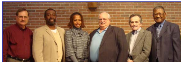
Board of Trustees