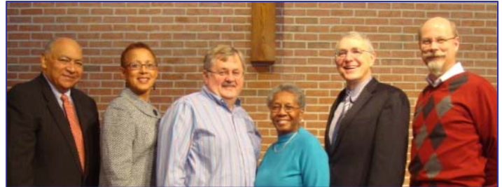
Board of Elders

We are pleased to announce the organization of all three of our church boards. Following their first meetings since Church Council, officers have been selected. (Numbers) indicate the number of years remaining on a board.